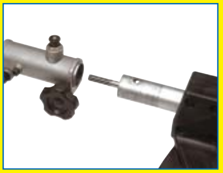
Quick release extension shaft. No tools required.